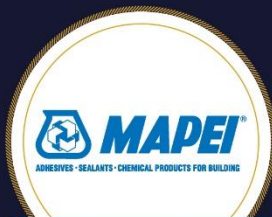
Mapei East Africa Ltd