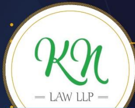
KN Law LLP