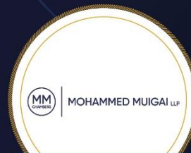
Mohammed Muigai LLP