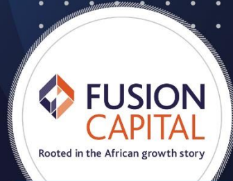
Fusion Capital Ltd