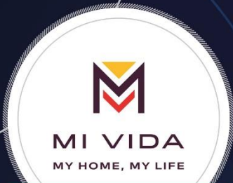
Prism Resident Ltd