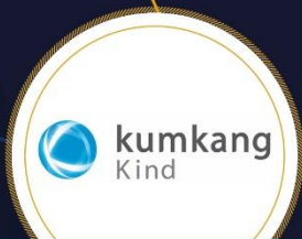
Kumkang Kind East Africa Ltd