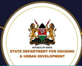
State Department of Housing and Urban Development